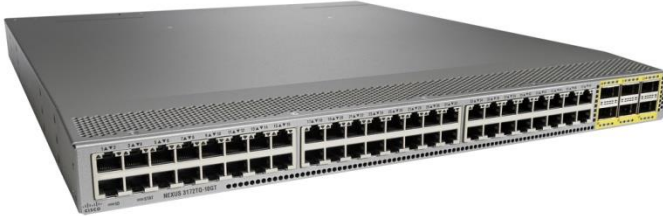
Figure 2. Cisco Nexus 3172TQ and 3172TQ-32T Switch