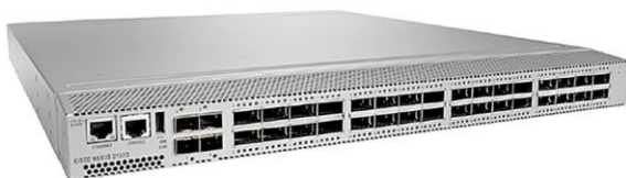
Figure 1. Cisco Nexus 3132Q Switch