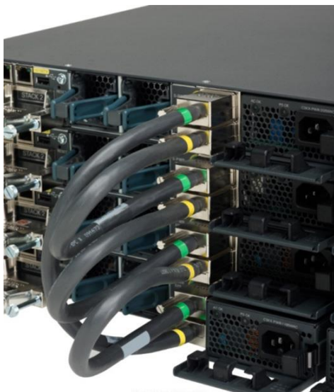
Figure 3. StackPower Connector

The Cisco Catalyst 3750-X Series introduces Cisco StackPower technology, innovative power interconnect system that allows the power supplies in a stack to be shared as a common resource among all the switches. Cisco StackPower unifies the individual power supplies installed in the switches and creates a pool of power, directing that power where it is needed. This feature is available in all Cisco Catalyst 3750-X Series Switches feature sets*. Up to four switches can be configured in a StackPower stack with the special connector at the back of the switch using the StackPower cable**, which is different than the StackWise cables. (See Figure 3.)