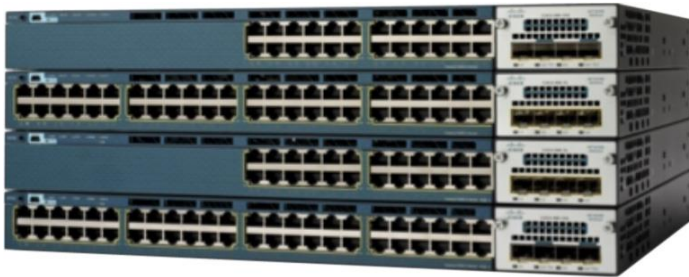
Figure 2. Cisco Catalyst 3560-X Series Switches

Table 2 shows the Cisco Catalyst 3560-X Series configurations.