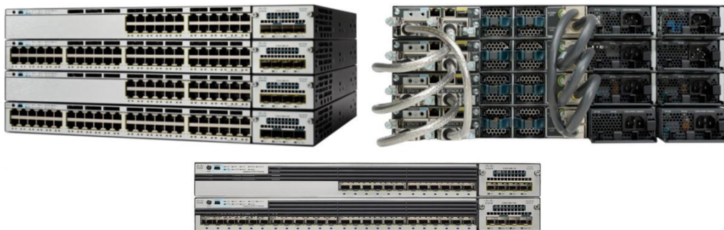
Figure 1. Cisco Catalyst 3750-X Series Switches (Front and Back)

Table 1 shows the Cisco Catalyst 3750-X Series configurations.