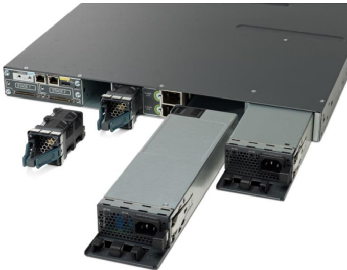
Figure 5. Dual Redundant Power Supplies

Table 6 shows the different power supplies available in these switches and available PoE power.